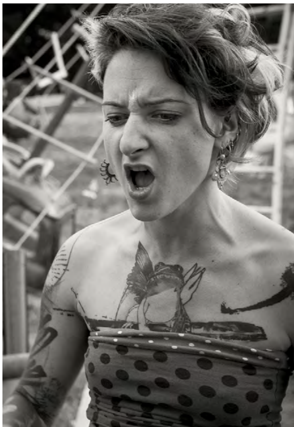
Marido: «I was born a woman, with female genitalia. And I'm fine with that. Is it lucky to be a woman? I think it is. But it's hard. It's very, very, very, very hard.»