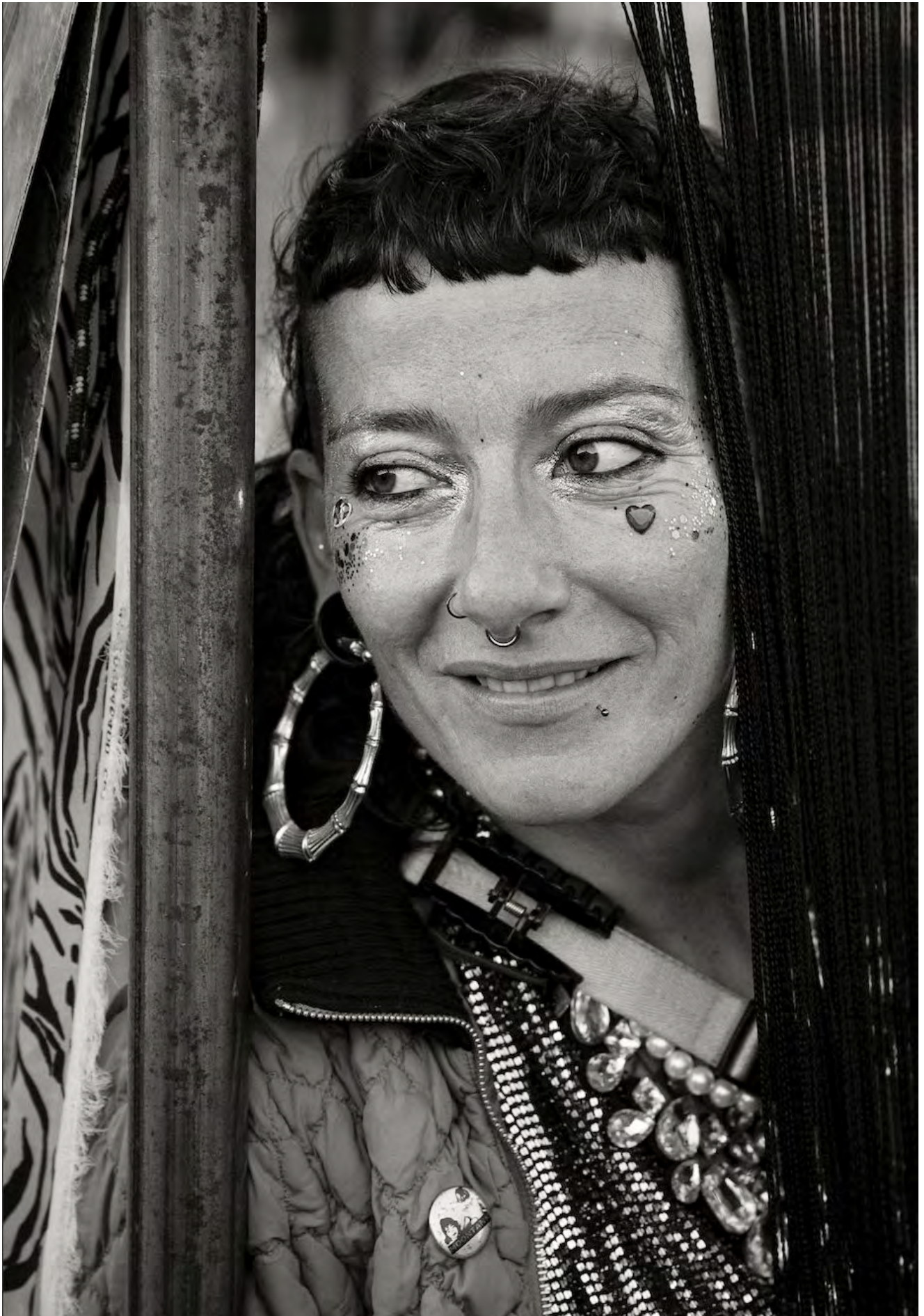
Cha: «Being human isn't eco-responsible».